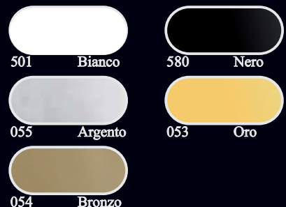
PA 500 Maniglia in alluminio