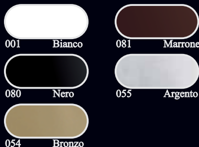
PA 507 Serratura in ABS