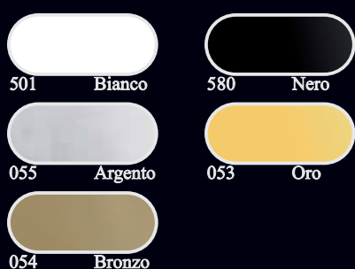
PA 402 Magnete in alluminio