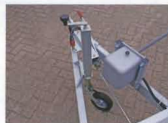
Retractable jockey wheel

All of our tipper trailers are three-way tippers, which means that you can tip the load backwards or to either side. To change the direction in which you tip the load you simply move a pin.