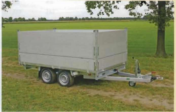
Loading ramps (optional)