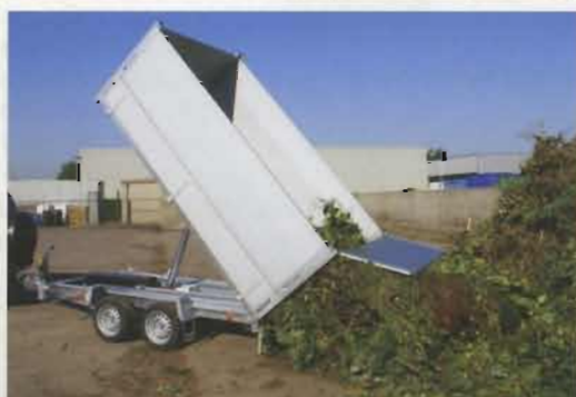
Extension sides (easy unloading)