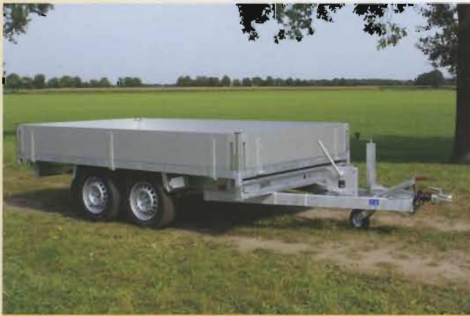
KSX 2000 H

The steel chassis of the tipper trailer is made up of two parts – an upper body chassis and a lower chassis, both parts are robot welded and hot-dip galvanised. The V-shaped drawbar is 145 cm long, which ensures great