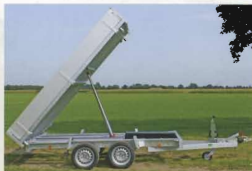
High rear tipping angle

Mex byggingavörur ehf. Lynghóls 3 Árbæjarhverfi Sími 567 1300 & 848 3215 www.byggingavorur.com