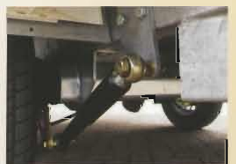
Axle shock absorber (optional)