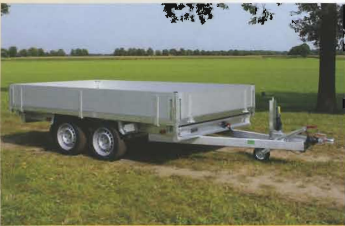
KSX 3000 E

road stability. The axle, overrun brake and coupling we use are of the highest quality. Due to the fact that tipper trailers often have to carry very heavy abrasive loads, ours have a steel floor plate that is 2,5 mm thick. The floor plate is a single piece of steel without any joints and is supported by many main and cross beams of the upper body chassis, which provides a very strong support for the floor plate.