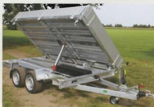
Tipping to the side (standard)