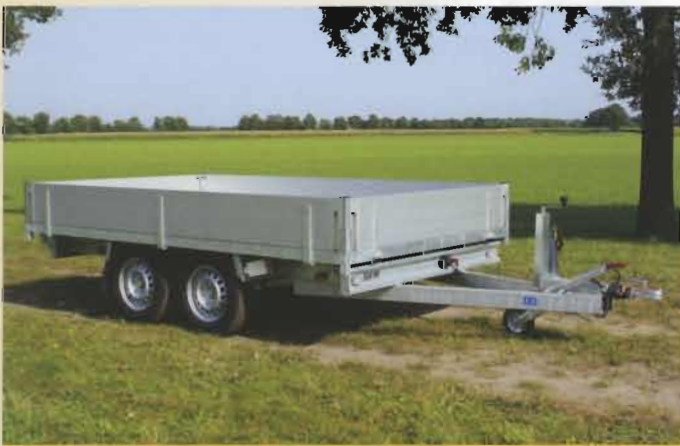
KSX 2000 E